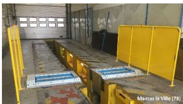
High security : Powder-coated steel Anti-crossing plate Warning beacon

Machine safety solutions compliant with: NFR 63-706