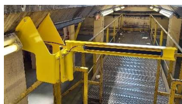
Pit safety : Infrared barrier Mounted on swing gate