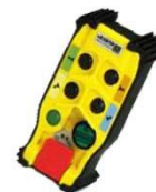
Security remote control: with emergency stop (optional)