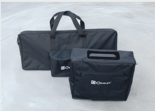
Carrying handle and storage bags.