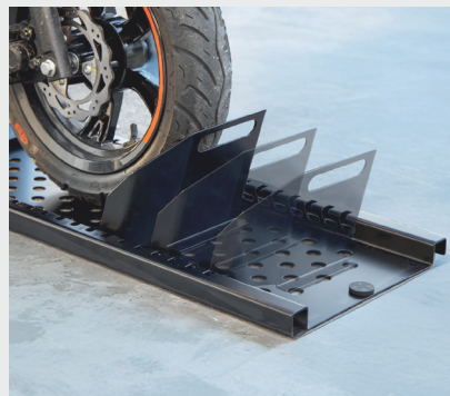
Adjustable locking and recentering rollers.