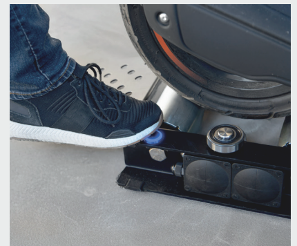
Start-up by foot.